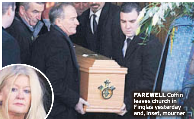
FAREWELL Coffin leaves church in Finglas yesterday and, inset, mourner