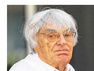
■ Bernie Ecclestone: Mercedes had done 'something magic'

"They are absolutely 100 per cent right," Ecclestone said when asked about Red Bull principal Christian Horner's statement that the governing FIA should apply an "equalisation mechanism" to narrow the gap. "There is a rule that I think [former president] Max [Mosley] put in when he was there that in the