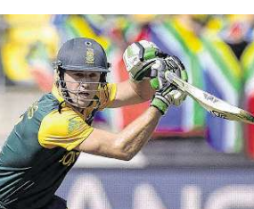
■ AB de Villiers: fell just one short of his century

De Villiers surprisingly fell one run short of his century, but will take consolation from having smashed four sixes to take his total to 20 at this showpiece - the most at the tournament - and a