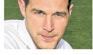
At this point I won't be involved with Kildare next year