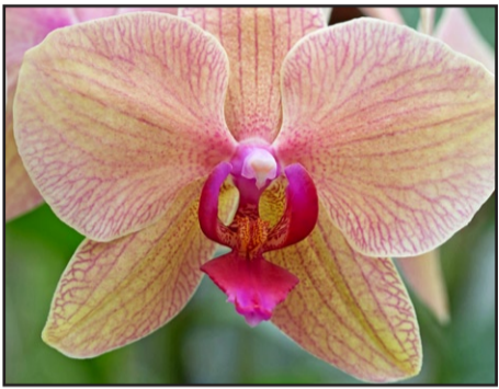
From another angle: The orchid