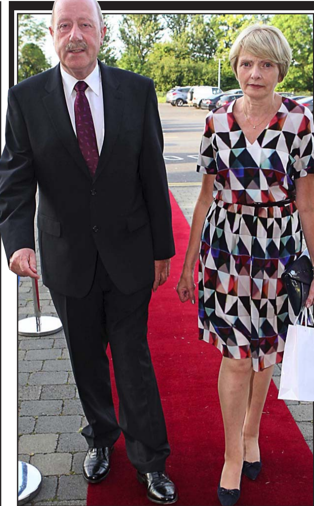
Red carpet treatment: Martin Callinan last night

Moon and Sun Moon rises: 5.20am, sets: 8.43pm Sun rises: Dublin: 5.31am, sets: 9.30pm Cork rises: 5.47am, sets: 9.33pm High tide: Dublin: 12.24pm Cork: 5.18pm Extremes (24 hrs to 6pm y'day) Warmest: Shannon, Co Clare, 27c (81f). Coldest: Mullingar, Co Westmeath, 11c (52f). Wettest: Shannon, Co Clare, 0.24ins. Sunniest: Belfast, Co Antrim, 13.7hrs.