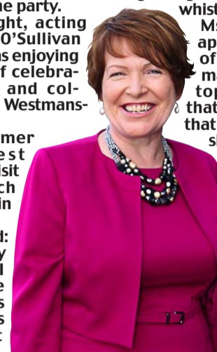
In the pink: Acting Garda boss Noírin O'Sullivan

She declined to speculate on whether she would take on the role at the top on a permanent basis. Instead she said: 'We're looking forward to having a good night tonight.'