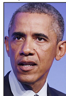
Alert: Barack Obama

tions and open a broader campaign against militants in Iraq. And following the beheading of two American journalists in Syria, Mr Obama began considering extending strikes into Syria. The president's spokesman said that he will go 'wherever is necessary to strike those threatening Americans'. Polls show the American people support a sustained air campaign. Currently 71 per cent support airstrikes in Iraq, up from 54 per cent just three weeks ago. And 65 per cent say they support extending airstrikes into Syria.